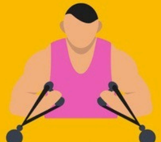
A LOT OF SPIRIT